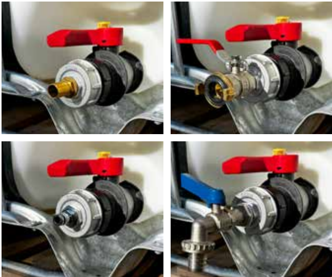
The 360° rotatable inner ring of the IBC adapter makes it easy to mount and align all components.