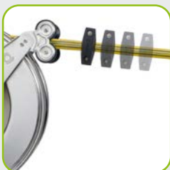
Automatic roll-up of the hose