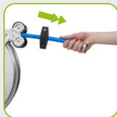
Locking mechanism can be controlled by pulling at the end of the hose