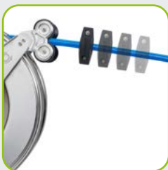
Automatic roll-up of the hose