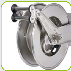
Robust stainless steel construction