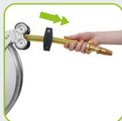
Locking mechanism can be controlled by pulling at the end of the hose