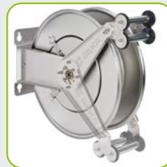
Suitable for wall, floor and ceiling mounting