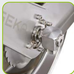
GEKA® plus rotary fitting with full 3/4" water flow