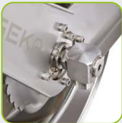
GEKA® plus rotary fitting and stainless steel pipe