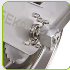
GEKA® plus rotary fitting with full 3/4" water flow